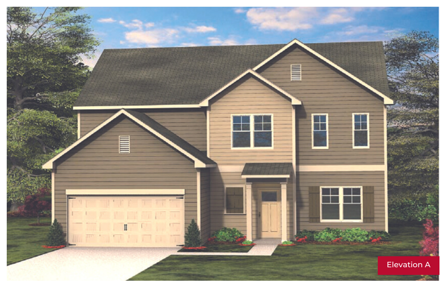
2 Car Garage