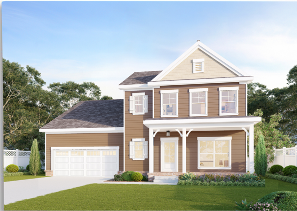
Arrington - Elevation B