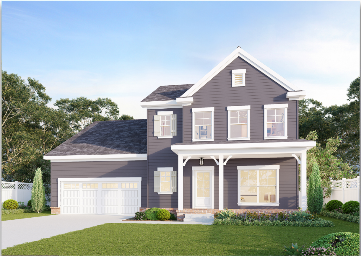
Arrington - Elevation A

2405 SQUARE FEET | 3-4 BEDROOMS | 2 1/2 - 3 1/2 BATHS