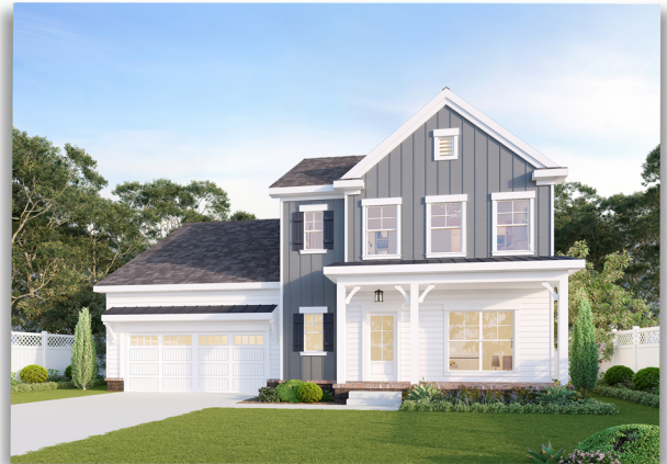
Arrington - Elevation C

5.17.20 Artist Rendering and Floor Plan Graphics are for demonstration purposes only; Actual Construction Materials and Floor Plan May Vary per Community. Information believed accurate but not warranted. Prices and specifications subject to change without prior notice. Sales and marketing by Paran Realty.