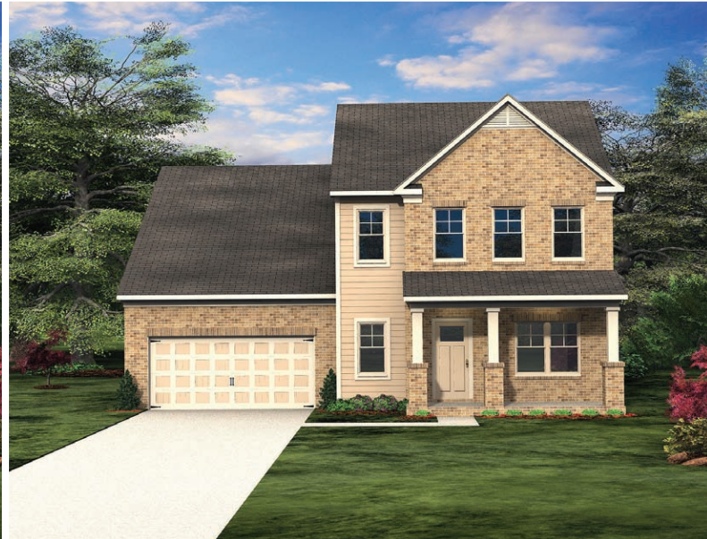
BEDMINSTER · D