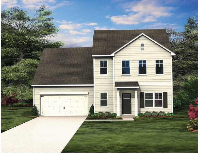
BEDMINSTER · A