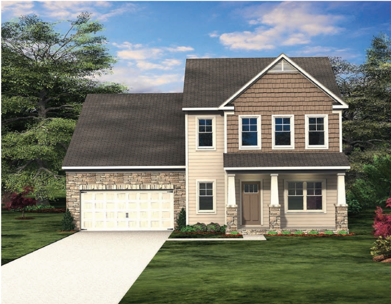
BEDMINSTER · C